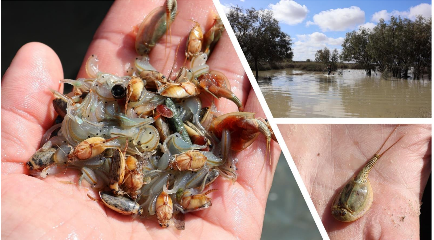
Left to right, clockwise: Picture 1: A diverse collection of aquatic invertebrates at Lake Littra, Chowilla Floodplain. Picture 2: DEW ecologists undertaking monitoring at Chowilla Floodplain. Picture 3: A single shield shrimp ( Troips australiensis ) found at Lake Littra, Chowilla Floodplain.

DEW ecologists also recorded high numbers of freshwater glass shrimp ( Paratya australiensis ), brine shrimp ( Parartenia sp. ), mussel larvae, and several species of water beetle. These macroinvertebrates play a vital role in the productivity of a wetland, providing food recourses for native fish and waterbird species.